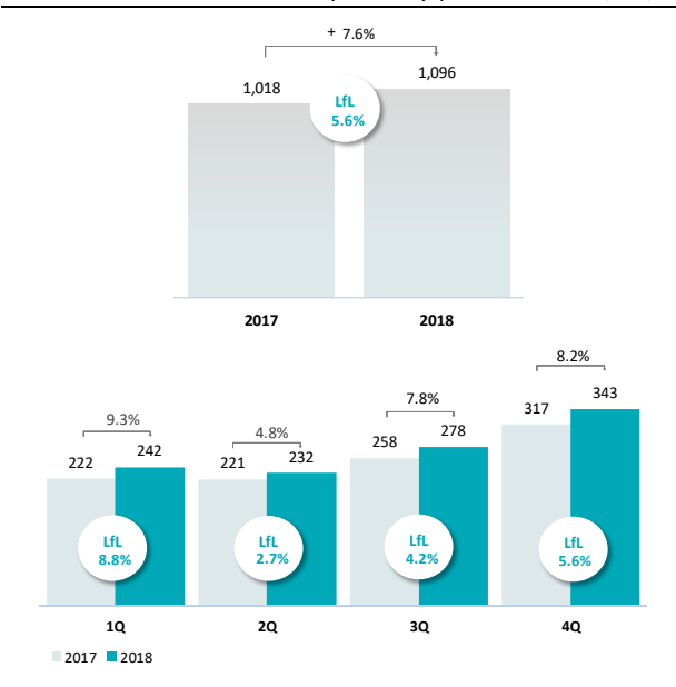
Sonae S&F sales: annual and quarterly performance (€M)